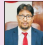
Showkat Ahmad Parry Deputy Commissioner, Bathinda.